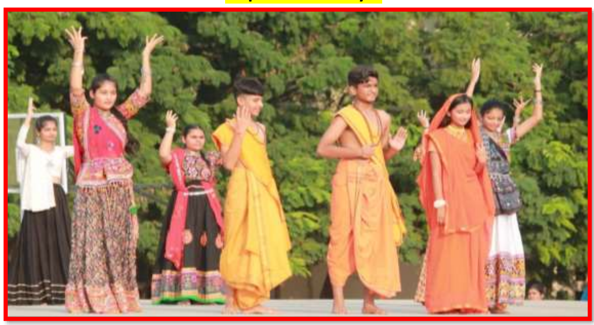
Inspiration of Day-7

positivity in them to create the life of their dreams and bring success and victory into their lives.