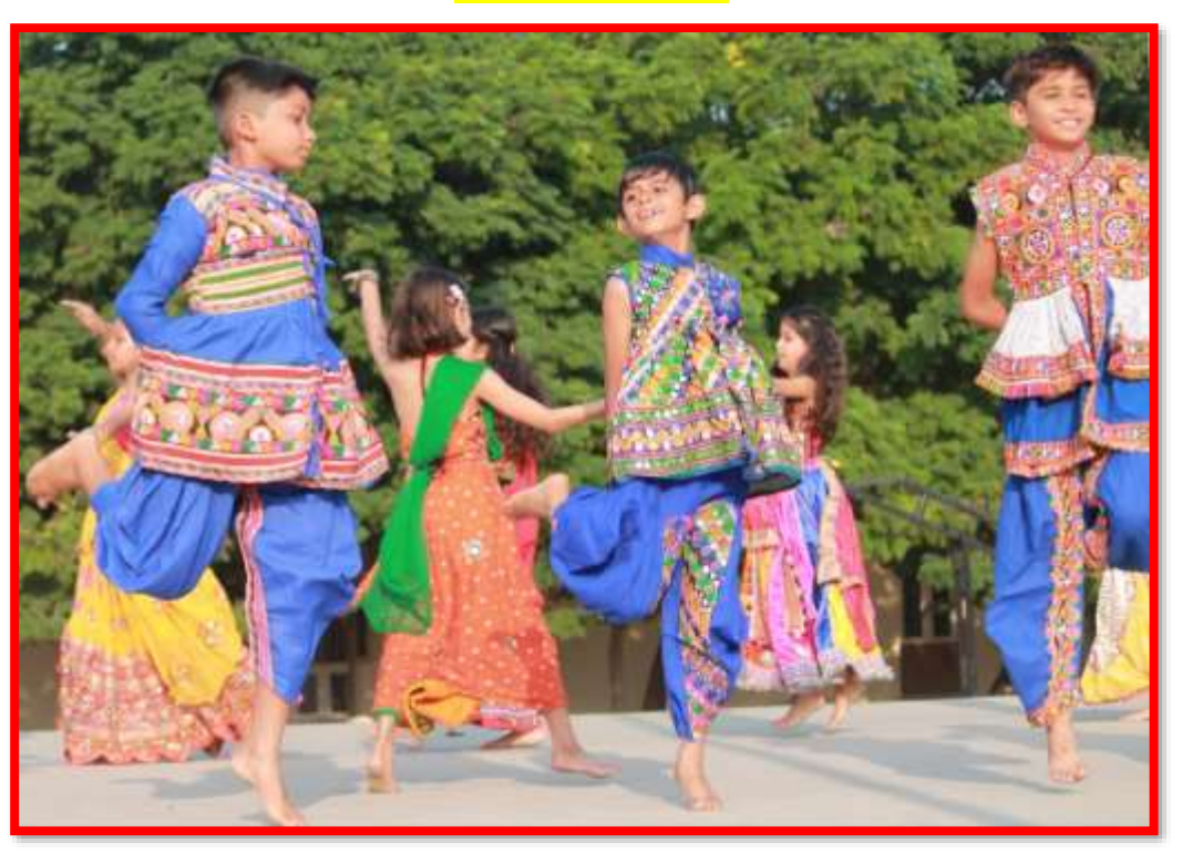
Beauty of Day-5

Day 5 is dedicated to Maa Shandmata, the goddess of motherhood and love. Tirth of class V highlighted the significance of this day. He shared Day 5 as a very auspicious day. To highlight the importance of pure and divine relationships, a wonderful performance was presented by the students of classes IV, V and VI. This day was indeed a day of bonding, where the gathering, the celebration and the dance etched a unique combination of joy, beauty and unity.