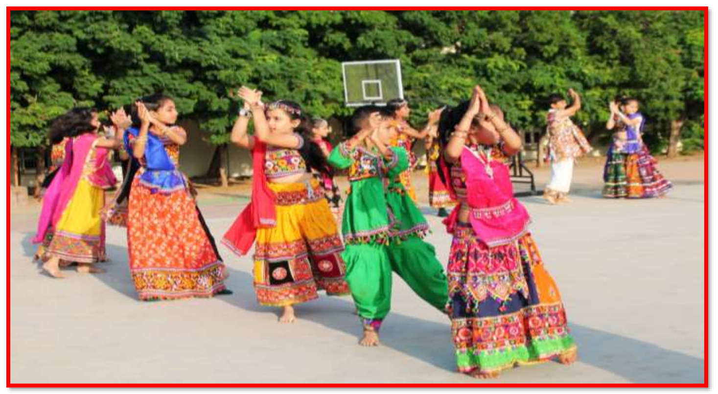
Navratri Celebration Day 5 (October 8, 2024)

Day 5 is dedicated to Maa Shandmata, the goddess of motherhood and love. Tirth of class V highlighted the significance of this day. He shared Day 5 as a very auspicious day. To highlight the importance of pure and divine relationships, a wonderful performance was presented by the students of classes IV, V and VI. This day was indeed a day of bonding, where the gathering, the celebration and the dance etched a unique combination of joy, beauty and unity.