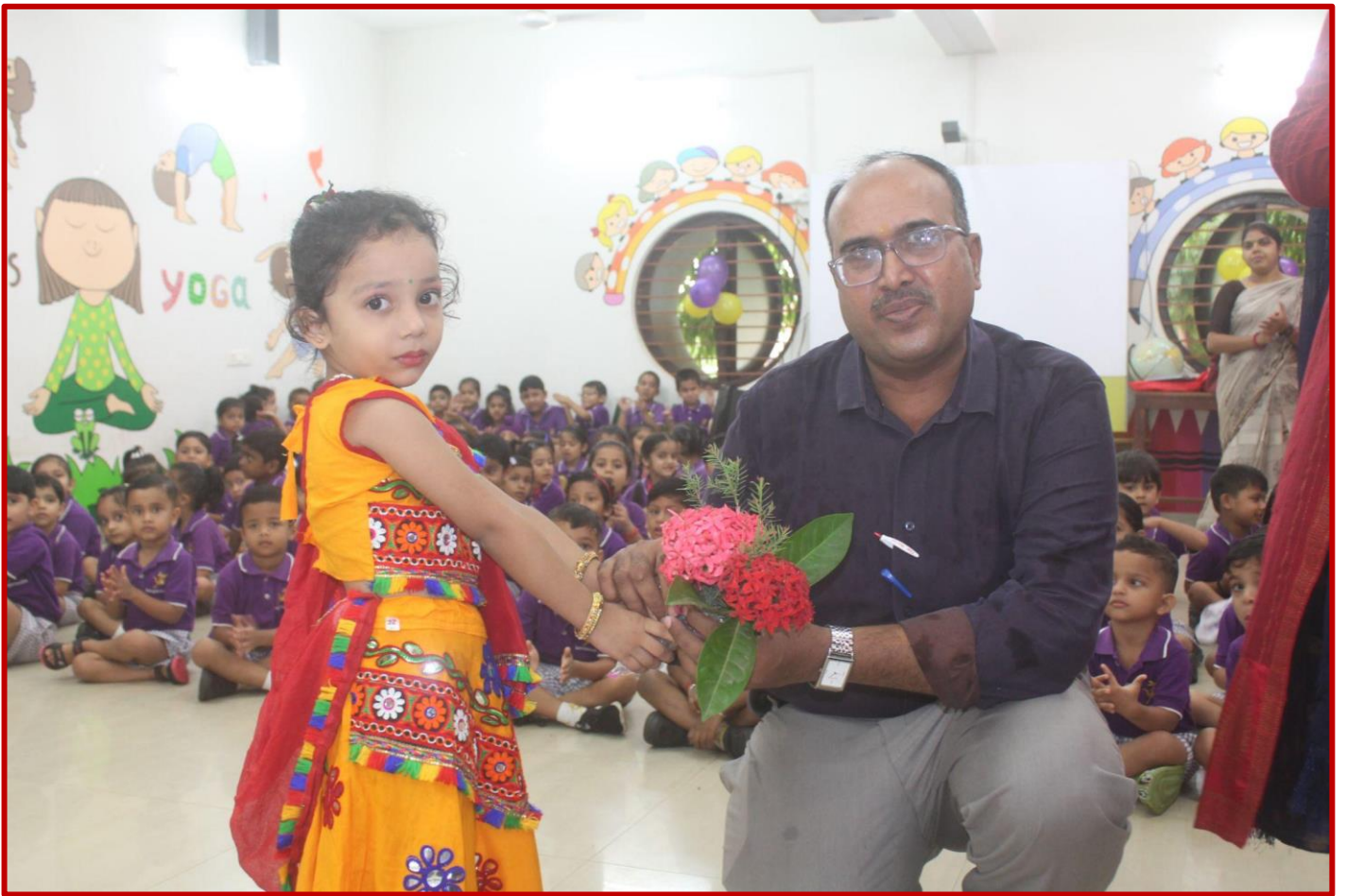
Hindi Teachers of Adani Public School