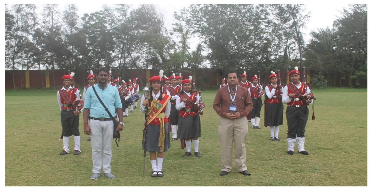
Patriotic Song by Students