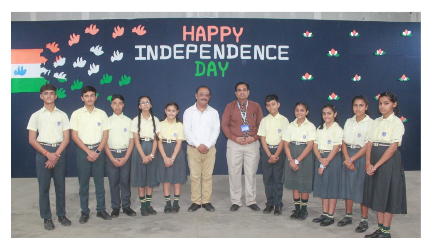
Speech by Students