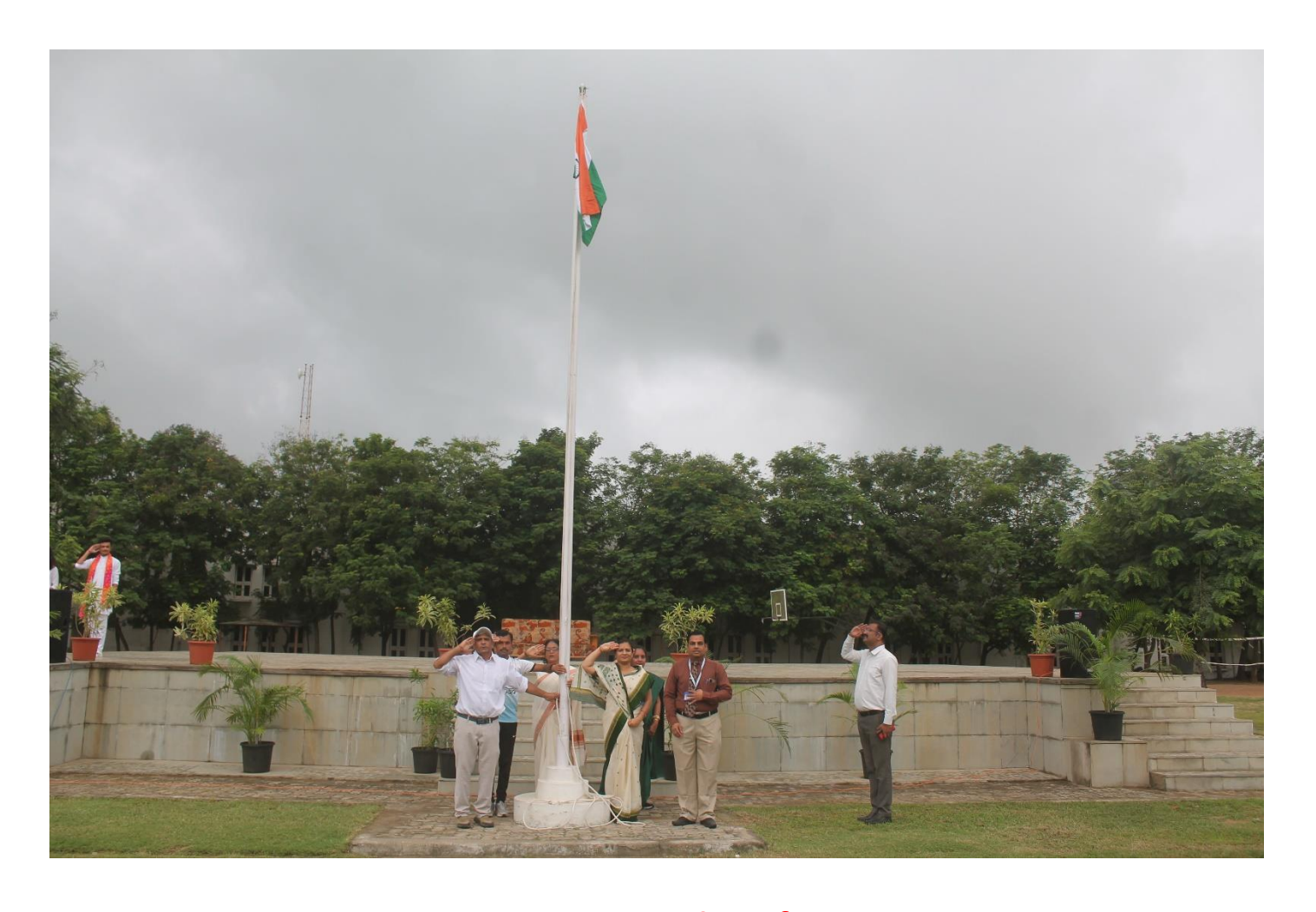
NCC & Bagpiper Band Performances