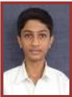
MEET RAVAL 89.60%